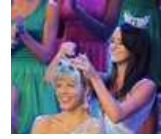
Miss Mississippi pageant