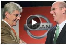
Nissan announcement Jun 28, 2012