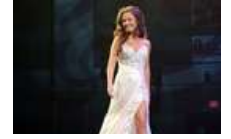
Miss Mississippi (Friday)