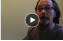
Jackson tech startup group Jun 4, 2012

$2.5M award against Kroger (The Clarion-Ledger)