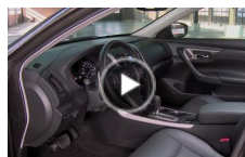
The 2013 Nissan Altima