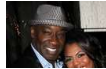
Michael Clarke Duncan remembered